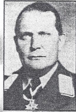
Hermann Goering, Hitler's Reich-Marshal at the Nuremberg Trials after WWII

"Naturally, the common people don't want war, but after all, it is the leaders of a country who determine the policy, and it is always a simple matter to drag people along whether it is a democracy, or a fascist dictatorship, or a parliament, or a communist dictatorship. Voice or no voice, the people can always be brought to the bidding of the leaders. This is easy. All you have to do is to tell them they are being attacked, and denounce the pacifists for lack of patriotism and exposing the country to danger. It works the same in every country."